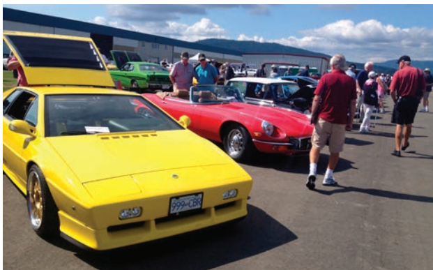
Some of the stock.

This year's Vancouver Island Motor Gathering, held on Sunday, August 16th, was a huge hit! An amazing array of classic, modern and unique cars and motorcycles were on display, with entertainment for the whole family. Once again, the Saanich Peninsula Hospital Foundation had our tent set up with a fun game that attracted kids and adults alike! Tremendous thanks goes to GAIN-VI for putting on this wonderful event and choosing our hospital to be one of the benefactors. We received a cheque for $39,475, and could not be happier!