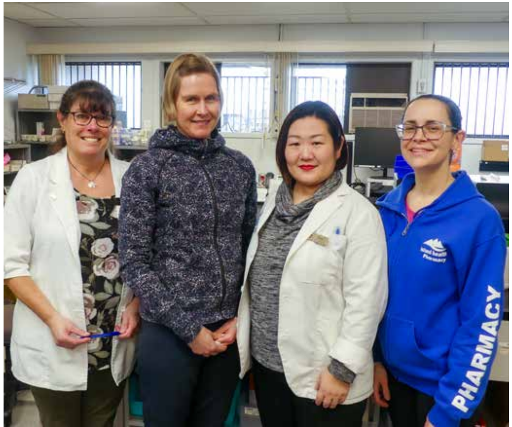
Saanich Peninsula Hospital pharmacy team.