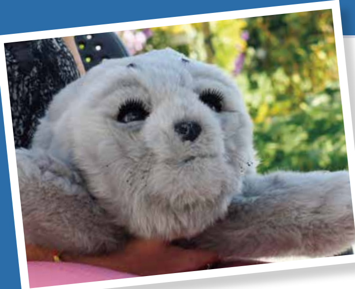
PARO the robotic harp seal is programmed with artificial intelligence and interacts with residents. The soft, strokable robotic seal is calming and comforting.