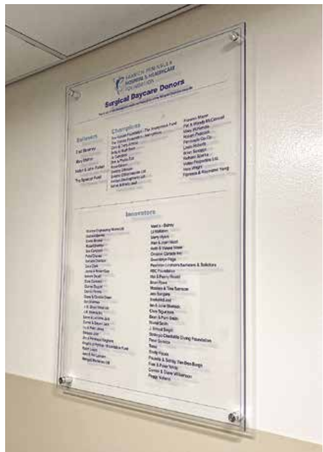
A special plaque to our donors who made the Surgical Day Care renovation possible.

Everyone at the hospital and you, our Foundation supporters, have the same passion and desire to make our hospital the finest community hospital anywhere. Thank you! ■